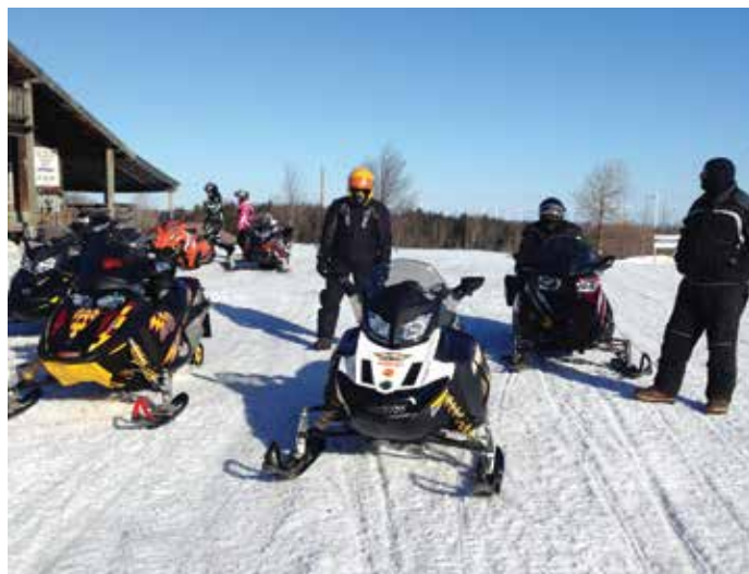
A couple of members from the Chesterfield Four Seasons Club took a field trip to Tug Hill, New York last year.

Enjoying the season? The snowmobiling is well under way and the conditions in New England look very promising. After last