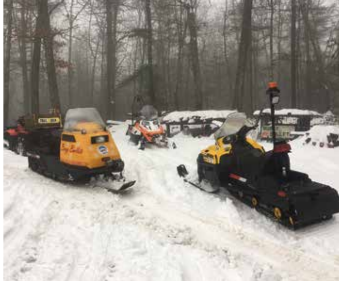
Burgy Bullets' groomer fleet is ready to go!

miles this year. Our club has been bust through the holidays trying to get to all our trails ready but it seems there just not enough time no matter when in the year you start. This year's first