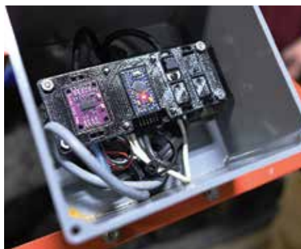
3D printed circuit board rack provides shock absorption and management for a handful of components.

of materials is essential. For this build I was fortunate enough to salvage several feet of 1.5" square tube railings from an old parade float. With a sufficient source of frame material, I began the design process with a 3D computer model of the drag. By digitally simulating the frame, I was able to visualize, test, and optimize frame geometries to better withstand the trail's harsh terrain. The number of blades, attack angle, cutting angle, cutting depth, and spacing had to be considered. The