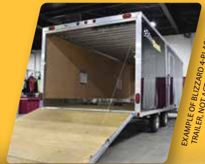
EXAMPLE OF BLIZZARD 4-PLACE TRAILER, NOT ACTUAL RAFFLE PRIZE