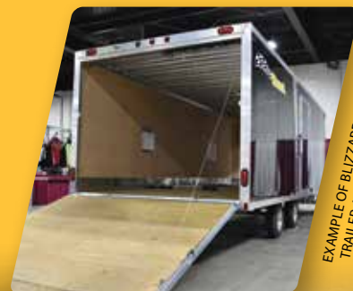
EXAMPLE OF BLIZZARD 4-PLACE TRAILER, NOT ACTUAL RAFFLE PRIZE