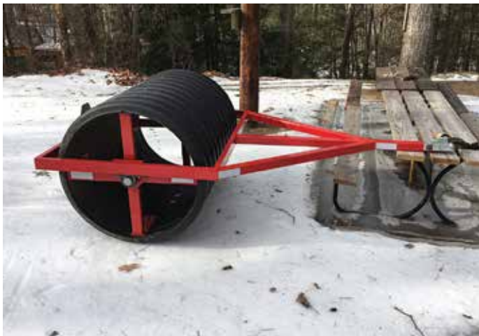
A new roller/packer fabricated by the "Burnache Boys" for the Burgy Bullets will make for smooth trails.

members step up and lend a hand with this job. We will advise you on a date for the work party on our newsletter and website. We hope to include a free dinner at end of the workday. Hopefully we will get some snow for the end of the season. It would be nice to be able to ride soon. If we do have rideable snow, we hope to have the club open on the weekends, but it's always best to give us a call at 413-296-4048 and think snow and cold for the rest of the season, please !