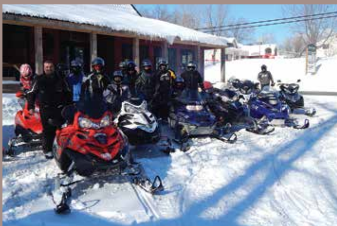
Easy Riders' winter picnic was a big hit.