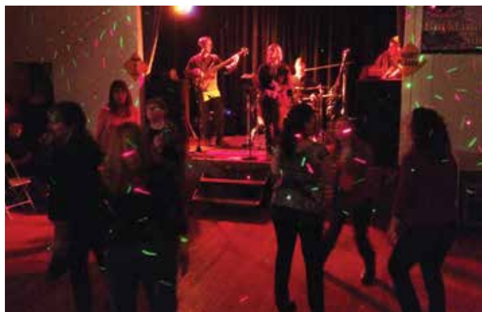
Good food and friends at the Buckland Riders Annual Dinner.

Hopefully everyone has enjoyed a great second half of the riding season. I'm writing this at the end of January and Mother Nature has not been kind to us so far. The clubhouse will still be open until the snow melts, check Facebook for hours each weekend. The annual "Leg-ends of Snowmobiling" dinner is scheduled for April 22 at our clubhouse and will be hosted by the Goshen Highlanders. There will be more info to come on all scheduled events, so watch our Facebook page. I would like to extend a huge thank you to all that helped keep the clubhouse open and the trails and bridges maintained and groomed. Also to the "Burnache Boys" for building us