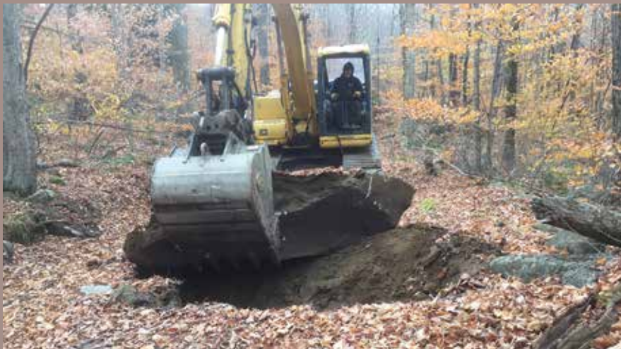
October Mountain State Forest's Rock Removal Project this fall as part of a Berkshire Snow Seekers RTP grant.