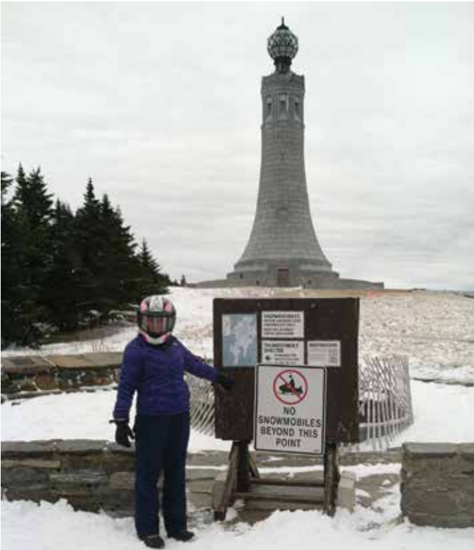
A sign reminds snowmobiles to stay off the sensitive area next to the monument at the summit of Greylock.