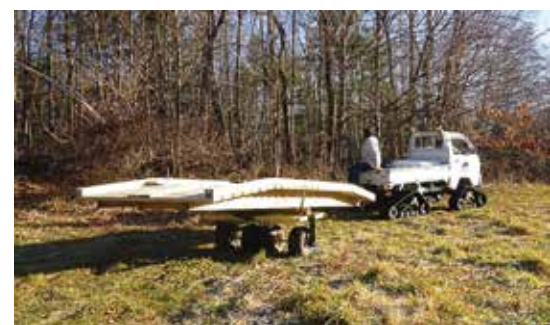
The BGL club deploys their top secret BDS, also known as the bridge delivery system.

Come and experience the excitement of snowmobiling in the Berkshires. Our first class groomer fleet consists of three Tucker Sno-Cats, a Thio-kol and two snowmobile-based groomers. Dues are only $60 for each snowmobile ($50 if you join before December 1) and they include a club membership, a SAM membership and a trail permit. Join via snail-mail (P.O. Box 1102, Pittsfield, MA 01202), via our website ( www.berkshire-snowseekers.com ), via a club meeting (7pm on the 1st & 3rd Tuesday of the month from September thru mid-April at the Skyline Country Club on Route 7 in Lanesboro, MA) or via one of our conveniently located trail permit outlets at a participating local business: - Pittsfield Lawn & Tractor (Pittsfield), Ronnie's (Pittsfield), Friendly Fred's (Windsor), Sangar's General Store (Windsor), Hinsdale Trading Company (Hinsdale) and Lanesboro BP Gas Station (Lanesboro). Please visit the SAM website to see our club's scheduled events and our grooming reports covering the October Mountain State Forest Area, the Pittsfield State Forest Area and the Windsor Area. Grooming reports are promptly posted in the SAM Forums by our trail coordinators within hours of grooming.