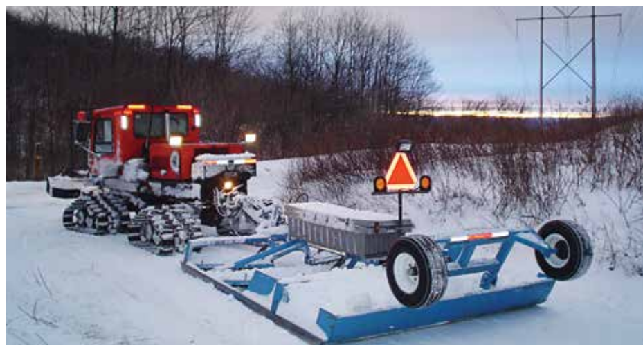
Berkshire Snow Seekers groomer makes it wide and flat in Pittsfield State Forest.