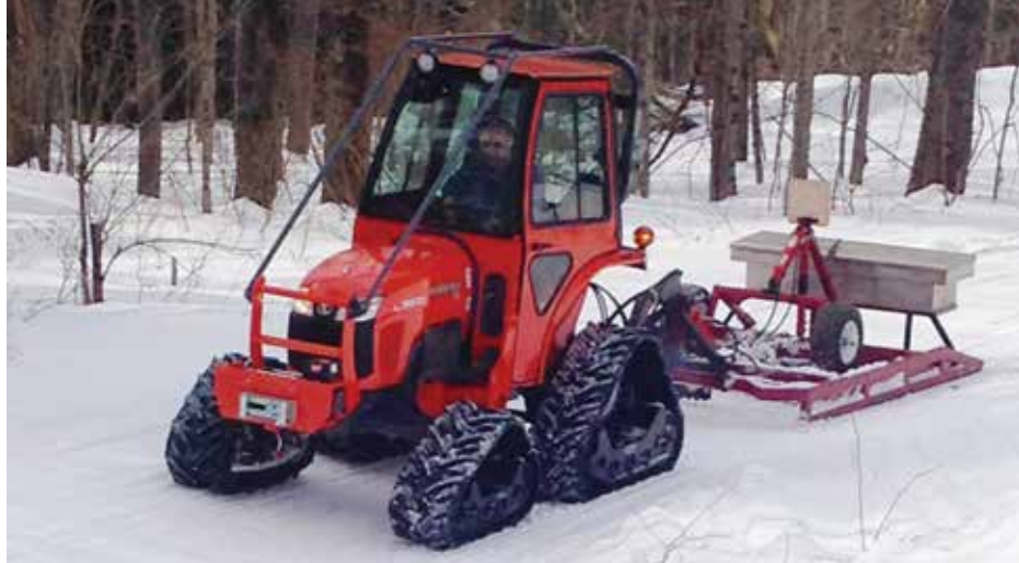
Worthington Snowmobile Club's new Kubota with MTN Drag, reporting for duty.

With snow right around the corner, the Porcupine Ridge Runners are gearing up for a great season of snowmobiling. We have several new members helping our trail crew prepare trails in Shutesbury, Wendell, New Salem and Leverett, but help is always needed and more members are always welcome. Our club relies