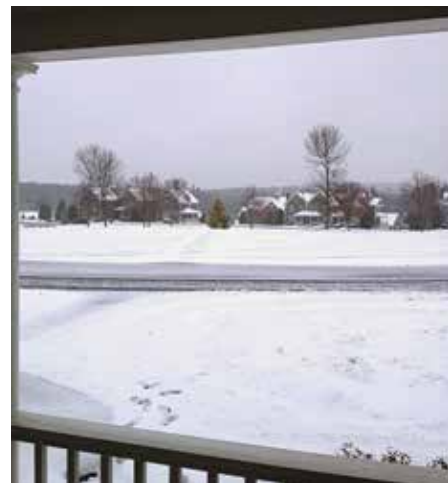
First snow in Harvard, mid-December 2013. Maybe it will snow in November 2014!

Wow! Another season coming at us. This will be our 45th season here on the trails in Harvard, MA. Our trails will be worked upon throughout the fall season. Lots of trimming, mowing and a few bridge repairs. Our trail groomer will soon awake from its long rest. That's right! We have a groomer with a drag and for the past three seasons the conditions have been incredible. Our trail system is about 25 miles in length and we ride every inch of it. We are always looking to improve and increase our system that passes through miles of conservation and private properties. Our relationship with the town and property owners has been great because we simply respect the privileges that have been granted to our club and its membership.