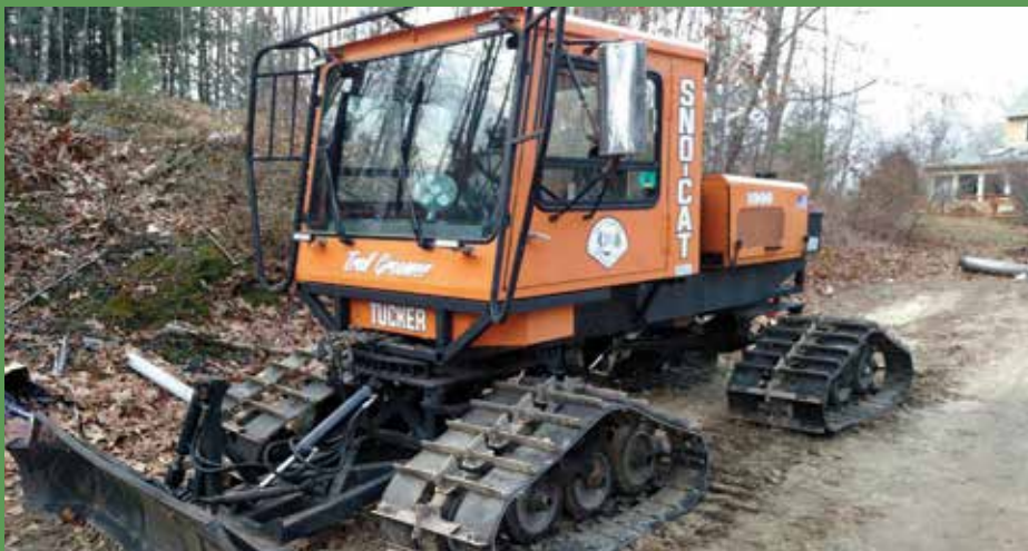
Hopefully snow is arriving soon for the groomer