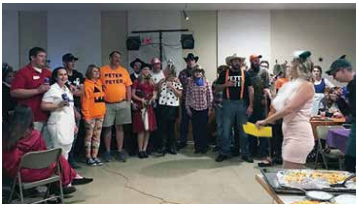
2017 Halloween Party at the Chesterfield Four Seasons club house.