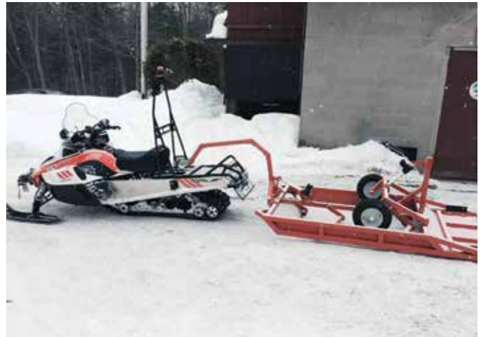
Burgy Bullets are ready to flatten some trails!!

We are so close, yet still so far away! The ground is frozen but our snow cover is light and fluffy and a couple inches short. But despite the last few weeks of brutal cold, ice storms and some snow, our volunteers have been repairing bridges and getting the bugs out of our groomers. With this light snow, I see lots of clubs struggling with those snowmobilers who feel they are above the rules. I wonder if they usually