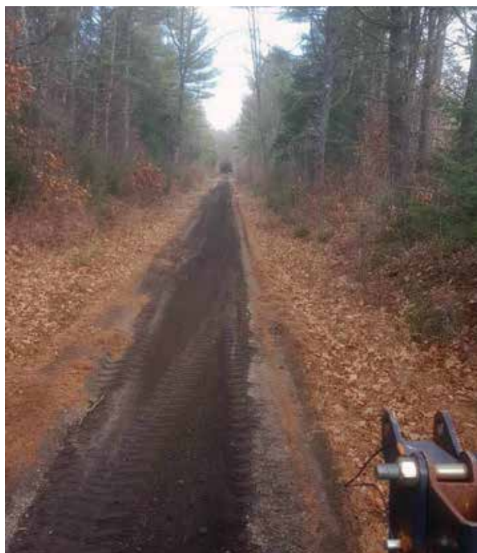
ITS 71 has been cleared, brushed, and graded.

We hope the snow continues to fly and everyone has a safe season.