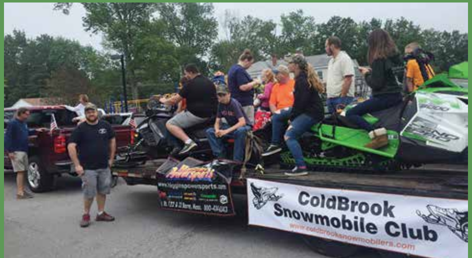
Some of our volunteers on the float we put together for the Hubbardston, MA 250th parade. Special thanks to Higgins Powersports for allowing us to use some brand new sleds!