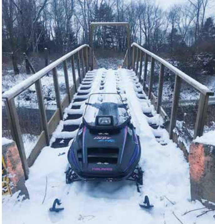
First tracks of the 2017-18 season over the Coldbrook seasonal bridge.