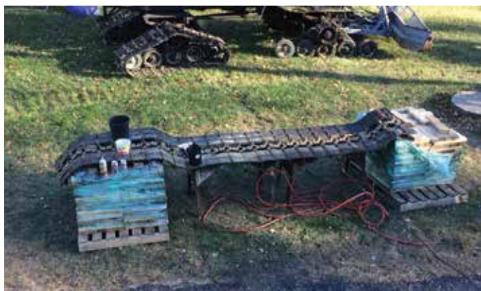
Replacing a track on one of the Coldbrook's Tucker Sno-cats.