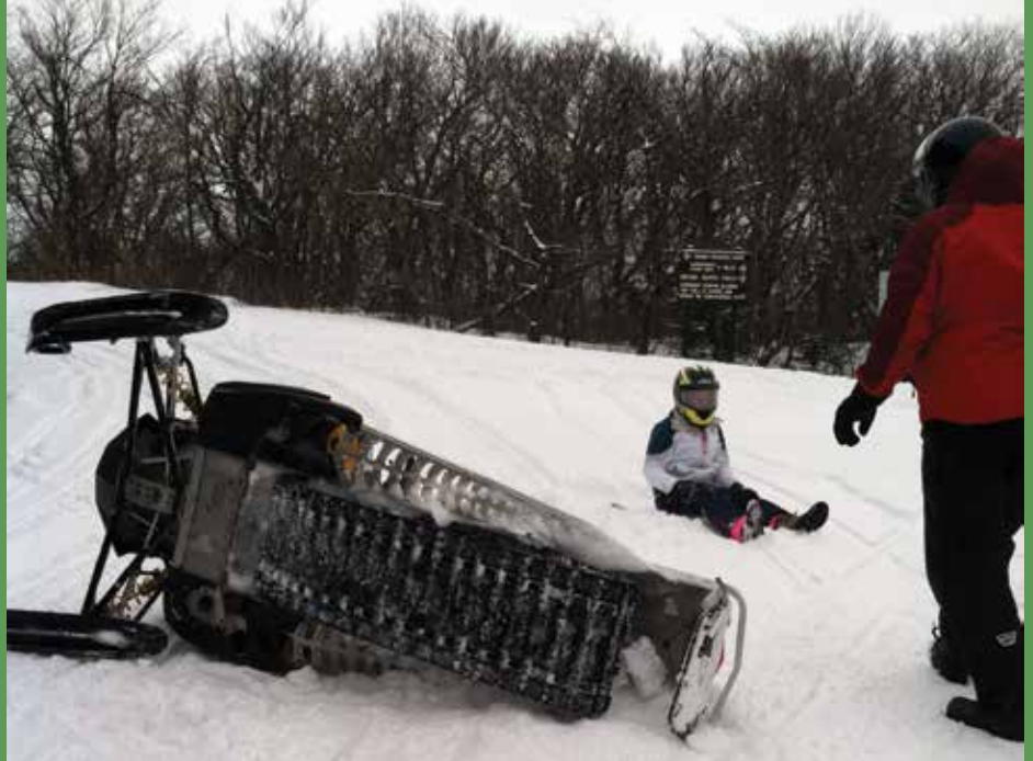
Novice Rider, Daytime, Perfect Trail Conditions, Speed approx. 15 mph, cause: ICE